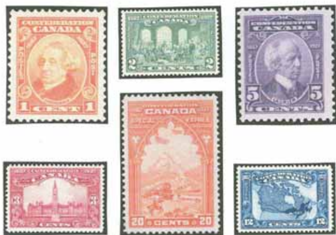
Commemorative stamps, including 20-cent special delivery stamp.

The most ambitious undertaking, however, appears to have been “the most extensive tie-in of radio stations ever attempted in Canada and possibly in the world.” At this time, the radio was still in its infancy. The linking of stations from coast to coast, 19 in all, included London’s CJGC, CNRO from Ottawa as the key station and Marconi beam station CF at Drummondville, Quebec. The latter in turn rebroadcast the program, on short wave-lengths, from Ottawa to Australia and to England, using two transmitters. England, in turn, broadcast to European receiving stations. The Canadian tie-in involved approximately $3 million worth of equipment, including 21,650 miles of telegraph and telephone wire and 53 repeaters to amplify the sound at approximately 200-mile distances. The initiative required 159 personnel. A test run was made on Sunday, June 26 th and reception was “remarkably clear, not only from the local station but also from Toronto and Ottawa.” 12 The broadcast program started at 10:30 a.m., eastern standard time, with music. Later, there were gun salutes, addresses from such dignitaries as the Governor General and Prime Minister William Lyon Mackenzie King, choir, bands and a string orchestra. The program ended at about midnight with the playing of “God Save the King.” 12