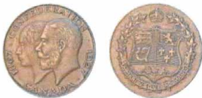
Obverse and reverse sides of the commemorative copper token.

The Dominion Government also had its impact on the city. A Commemorative copper token was minted and distributed throughout the country. Six special brightly coloured jubilee stamps, one being a special delivery stamp, were designed and first made available to the public on Wednesday, June 29 th . London’s allotment of 400,000 stamps arrived on Saturday, June 25 th and proved to be “extremely popular” on the first day of sale. 11