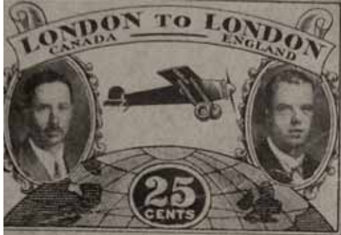
Copy of rare proof of London to London air mail